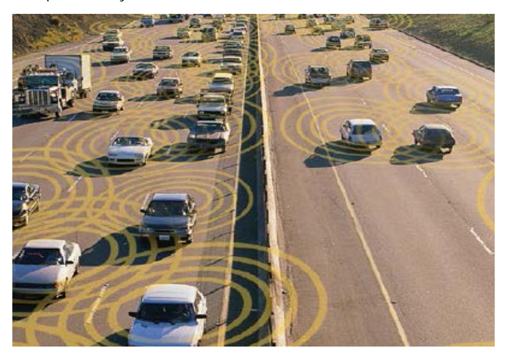
Connected Vehicles – In this depiction of connected vehicles, warning systems and sensors alert drivers to traveling conditions around the vehicles.

CDOT's approach will address technology in all stages of the planning process, from broad statewide policy setting and long-range transportation plan development through project development. These efforts will ensure that decision-makers at each step of planning benefit from the most current technology information available. In conjunction with its RoadX Program, CDOT has already initiated work on several elements and will continue to partner with other state agencies, technology experts, and the private sector to better forecast and adapt to the potential impacts of CAVs on Colorado's transportation system.